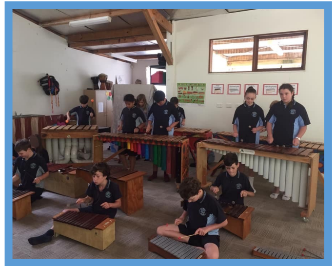
Buddies and Music