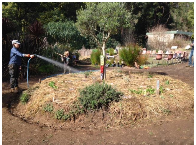
A newly renovated pizza garden with many donated plants raised by Emily (with hose).