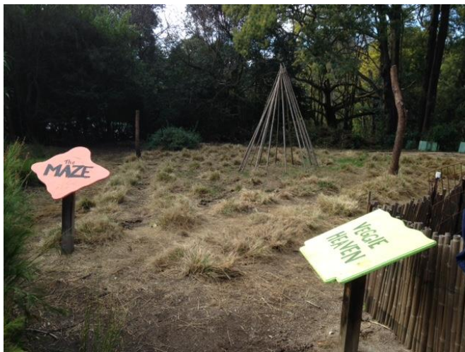
A freshly cut maze, an annual freshen up.

The atmosphere was wonderful and many people met others previously unknown in the school community. A big thank you is extended to all our generous volunteers and our tireless garden team who organised and oversaw the event. Here are a few images of the morning ☺