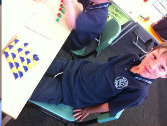
The children working to create 'continuous' and 'growing' patterns.